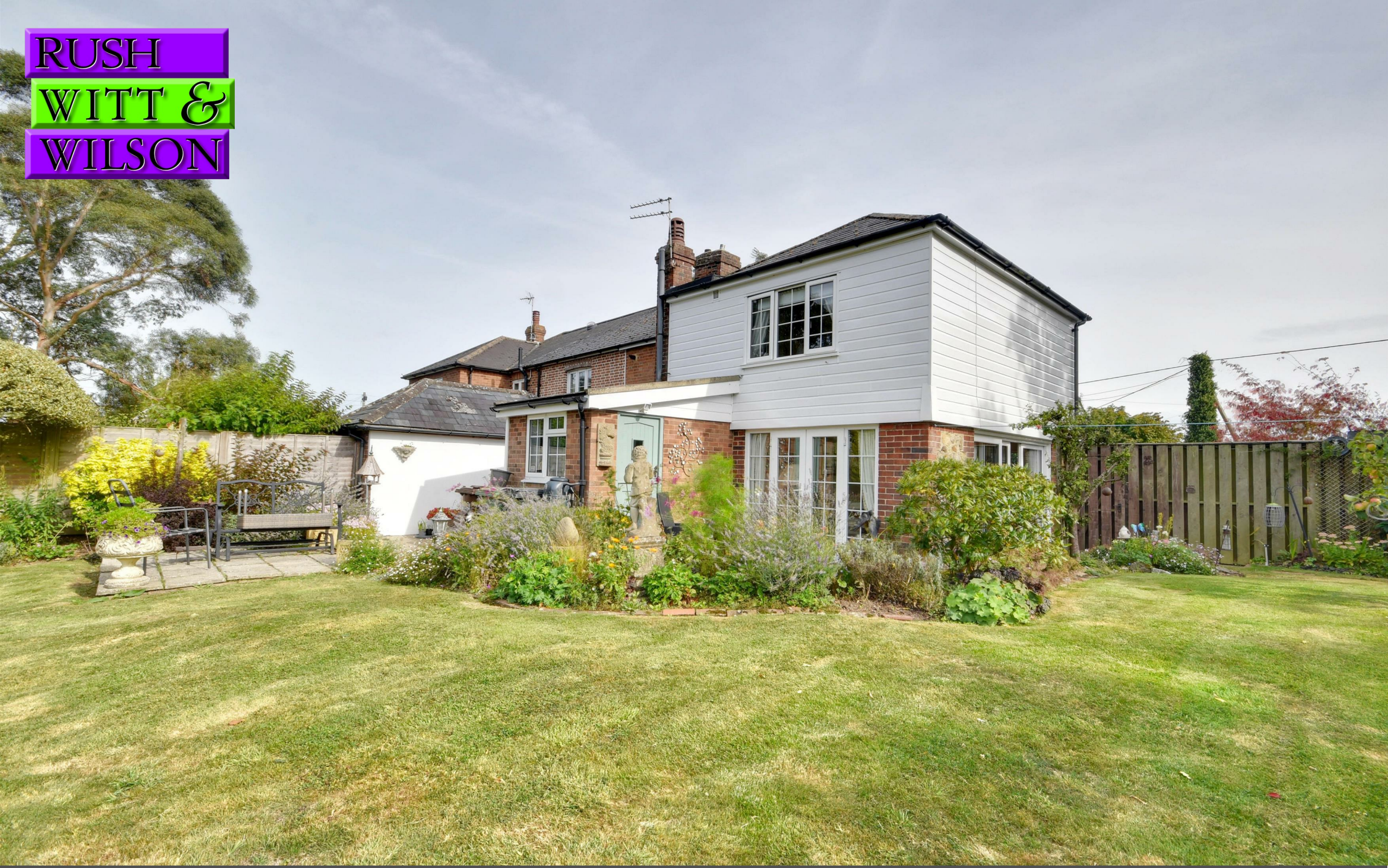
Faith Cottage Elms Lane, Hastings, East Sussex TN35 4JD Guide Price £525,000 Freehold